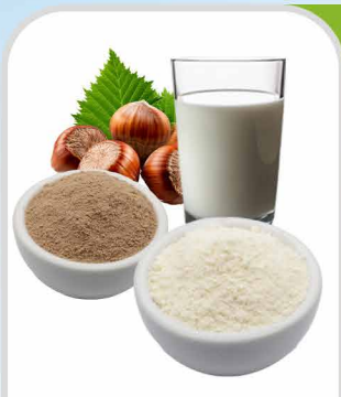
Instant Hazelnut Milk Powder

Application : Ready to Drink, Dairy, Beverage & Coffee Ingredient