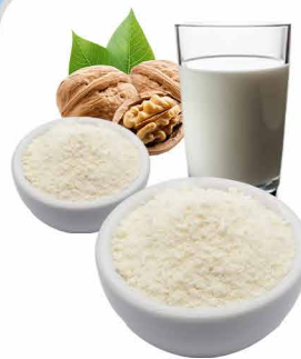
Instant Walnut Milk Powder

Application : Ready to Drink, Dairy, Beverage & Coffee Ingredient