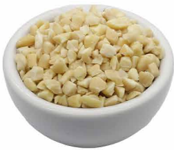
Chopped / Diced Almond

We are one of the largest almond processor in Southeast Asia, having our own processing plant in Indonesia. We are committed to produce fresh quality product using state of the art technologies with high hygienic processes.