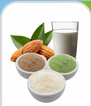
Instant Almond Milk Powder

All kind of Nuts: Almond, Pistachio, Oat, Hazelnut & Walnut are processed with our new technology and can be naturally transform into instant powder to be easily applied as a basic ingredients with free lactose for beverage as well as food industries. It is suitable to cater the growing healthy lifestyle market which are promoting for your business.