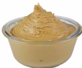
Peanut Butter Chunky

Application : Sandwich Cream, Wafer Cream, Biscuit Cream, Cookies, Pie, Doughnut Cream, Cake & Bakery