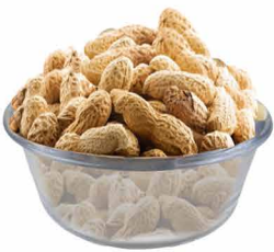
Roasted Peanuts In Shell

With our latest state of the art facilities, we are ready to produce various types of customized nut snacks. We are open for OEM (Toll Manufacturing) and private label business