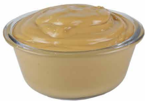
Peanut Butter Creamy

Application : Sandwich Cream, Wafer Cream, Biscuit Cream, Cookies, Pie, Doughnut Cream, Cake & Bakery