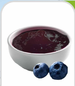
Dipping Sauce Blueberry

Application : Doughnut Topping, Ice Cream Topping, Bread Topping Cheese Cake Topping, Yoghurt topping, Smoothie Topping & Drink Topping