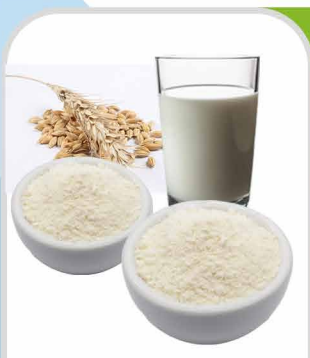
Instant Oat Powder

Application : Ready to Drink, Dairy, Beverage & Coffee Ingredient