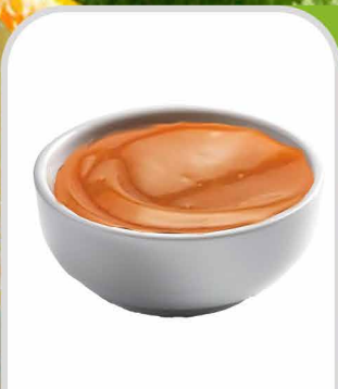
Caramel (Non Dairy)

Application : Doughnut Topping, Ice Cream Topping, Bread Topping Cheese Cake Topping, Yoghurt topping, Smoothie Topping & Drink Topping