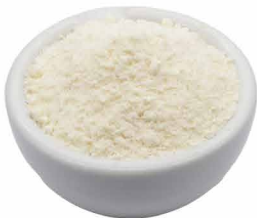
Diced / Extrafine Almond

Application : Wafer Cream, Biscuit Cream, Crepes, Bakery, Cookies & Biscuit