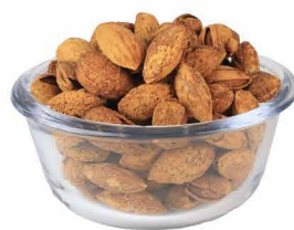
Roasted Almond in Shell