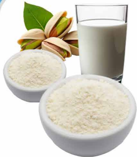
Instant Pistachio Milk Powder

Application : Ready to Drink, Dairy, Beverage & Coffee Ingredient